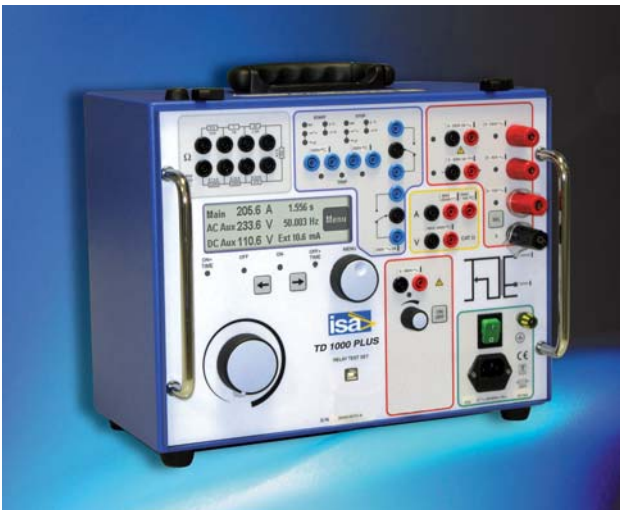
TD 1000 PLUS 15 Hz