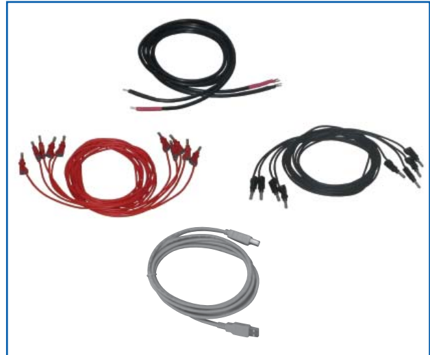
TD 1000 PLUS - Standard cable kit

The kit includes cables for any kind of connection.