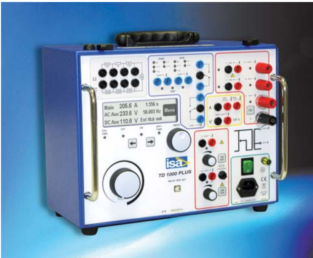
TD 1000 PLUS